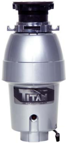
1/2 HP MID DUTY